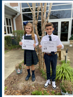
4: Kennedy & Carter