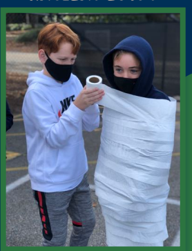
2<sup>nd</sup> Grade BUILDING PINCH POIS