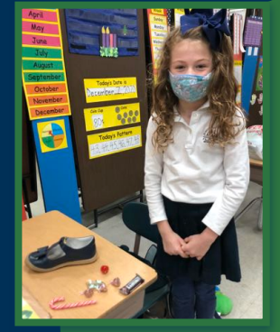
1st Grade ST. NICHOLAS DAY